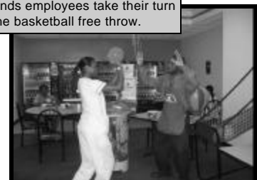
Shands employees take their turn at the basketball free throw.

And the fundraising continues...The second annual UF & Shands Jacksonville 3-on-3 Basketball Tournament is scheduled for Saturday, April 21, 2007.